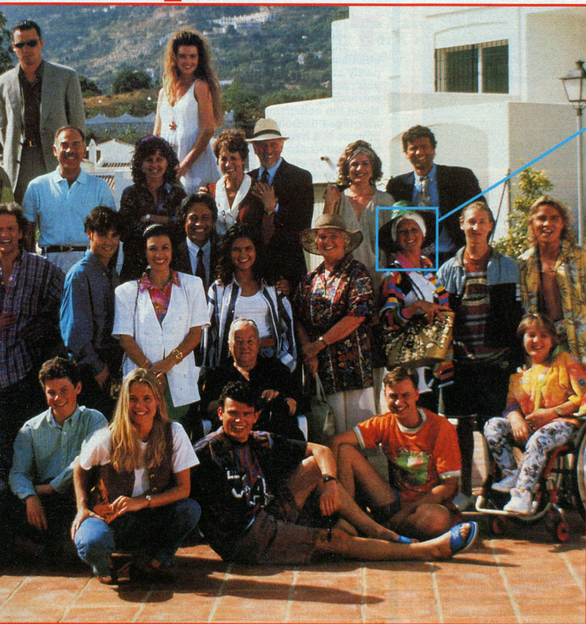
va España! The British ex-patriots who live in the imaginary soap-town of Eldorado get together for a holiday snap